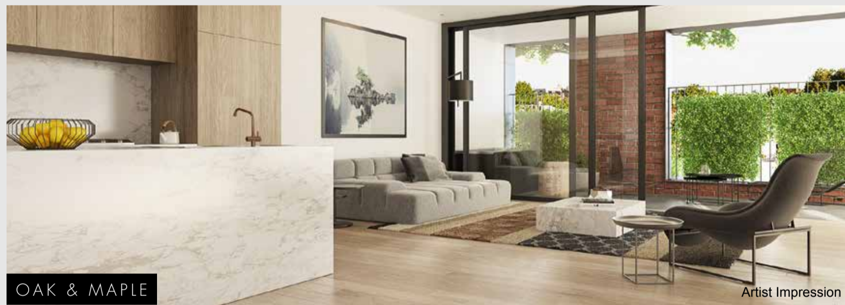
OAK & MAPLE

In the heart of Fitzroy on a quiet residential street lined with mature plane trees and Victorian terraces, a few minutes' walk from the vibrant buzz of Brunswick and Smith streets. Napier Street is also home to Fitzroy's grand 1863 town hall and primary school.