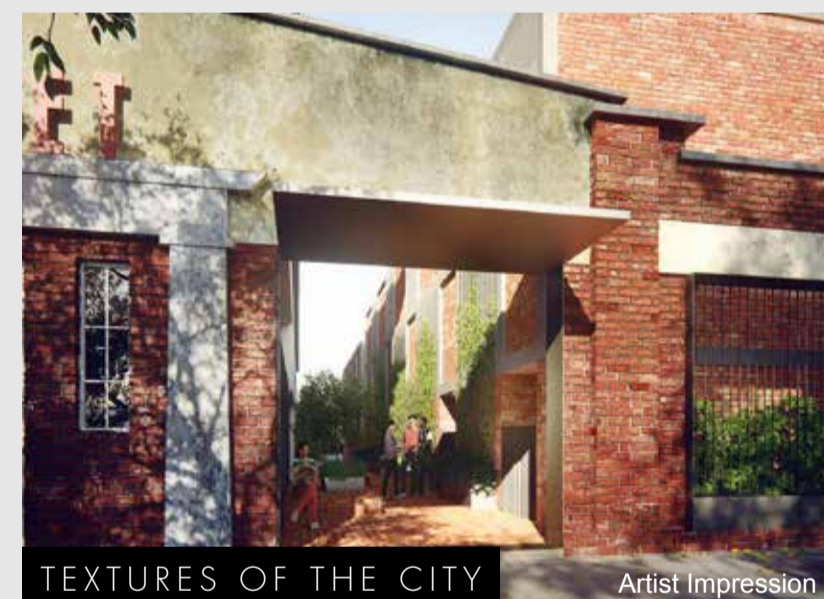
TEXTURES OF THE CITY

As in the kitchen, the bathrooms include weathered organic brass tapware. In the main en suite a full-height central divider has a floating double vanity in marble and timber veneer on one side, shielding the walk-in shower and toilet from view on the flip side. There's also a curved freestanding bath in the main en suite.