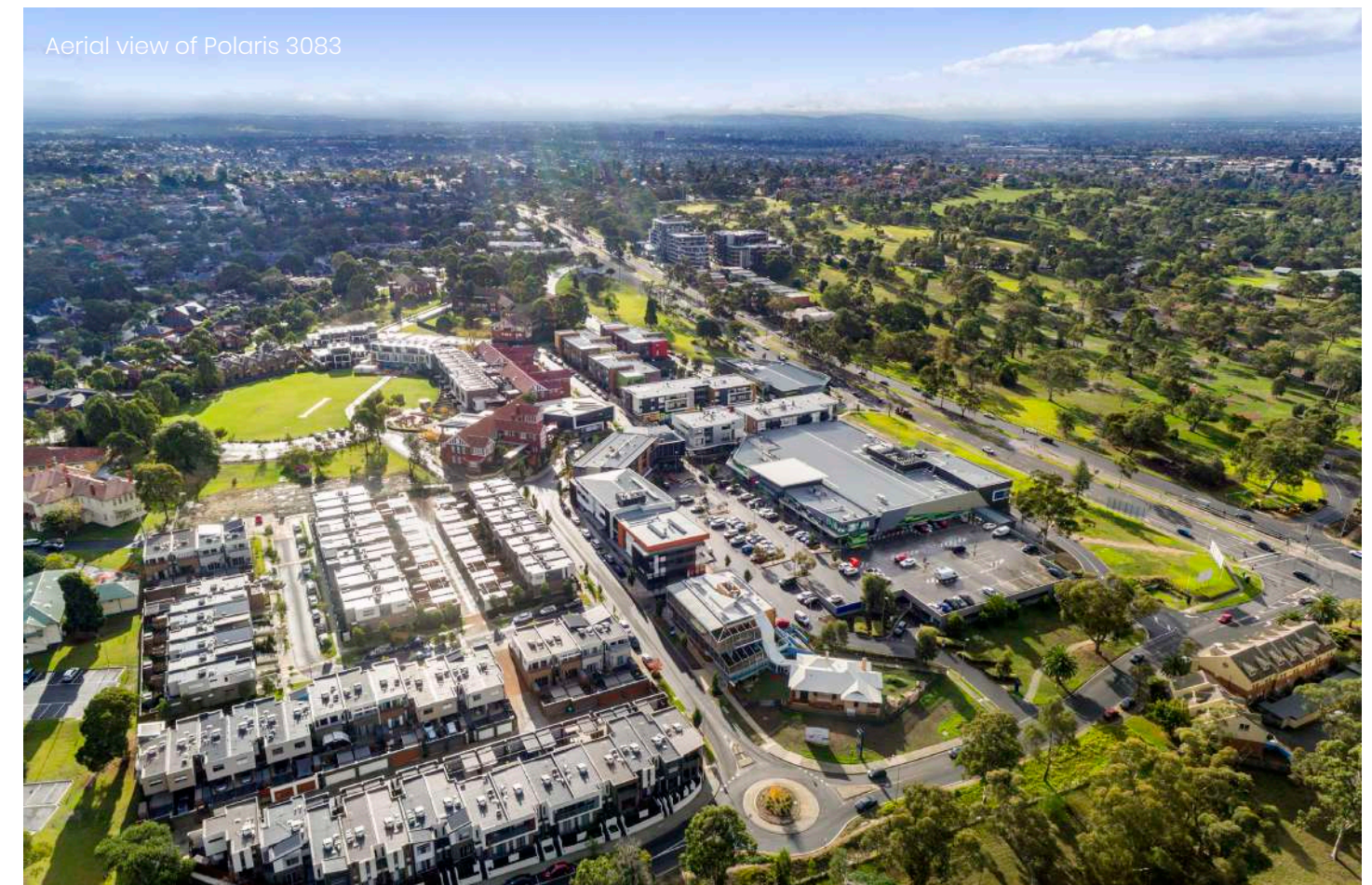
Aerial view of Polaris 3083