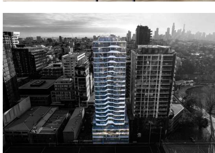
Photo taken of East facade July 2020