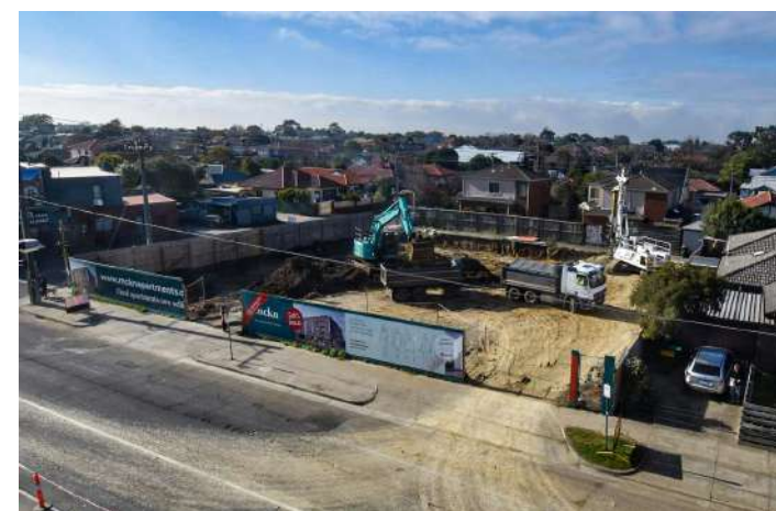
Breaking ground onsite