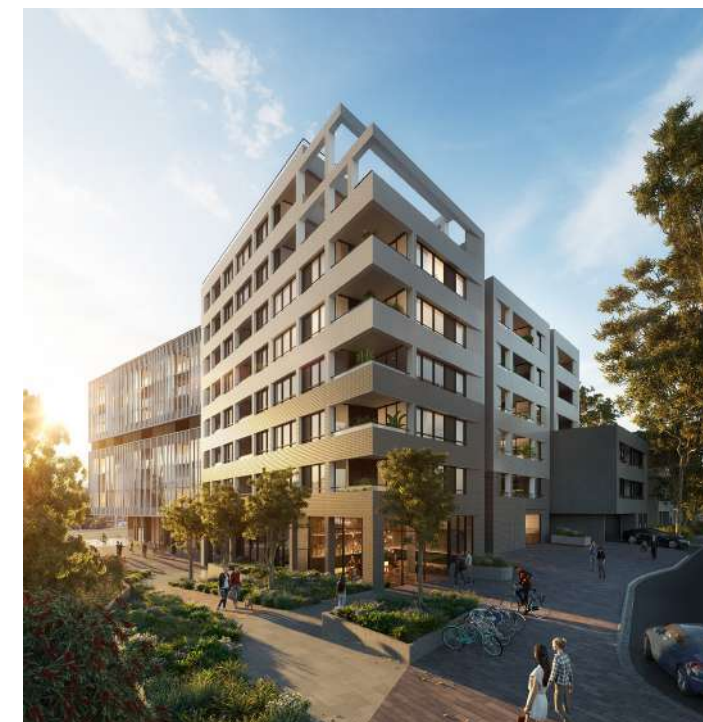
Glenarm Square - Artist impression